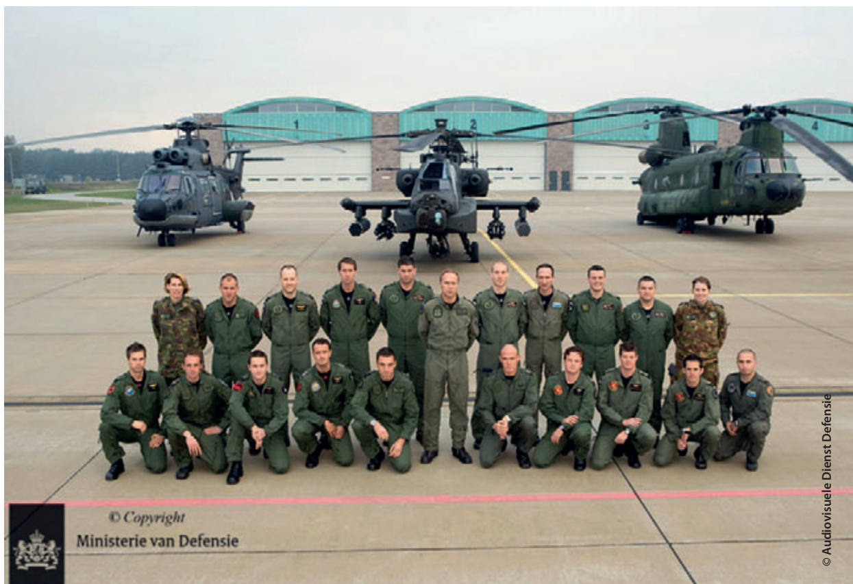
The Netherlands Helicopter Weapon Instructor Course with their AS-532 Cougar, AH-64D Apache and ICH-47D Chinook.

School (Buzau). They accomplish mountain training in Romania itself. They consider possibilities for foreign units for mountain training and fire ranges at Bacau and Campia Turzii.