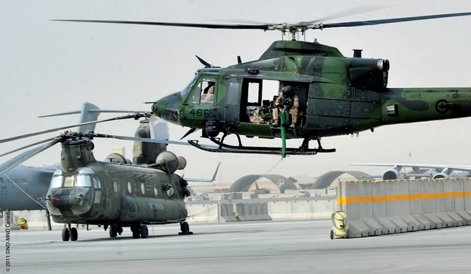
Canadian BELL CH-146 GRIFFON and CH47.