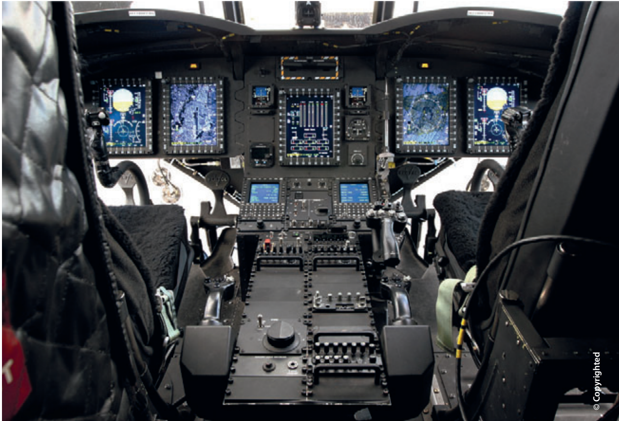
US CH-47F Cockpit.

US Army. The US Army and Army National Guard have UH-60, HH-60, AH-64, CH-47, UH-72 and OH-58 helicopters. Their helicopters are organised under (regular) Army Aviation commands in 12 Divisional and 2 separate Combat Aviation Brigades (CAB) and 8 CAB's with Army National Guards. A regular Army CAB can be 'Heavy' (48 AH-64, 38 UH-60, 12 HH-60 and 12 CH-47 = 110 helicopters) or 'Full Spectrum' (24 AH-64, 30 OH-58 Kiowa Warrior, 38 UH-60, 12 HH-60 and 12 CH-47 = 114 helicopters). The National Guard CAB consists of 24 AH-64, 32 UH-72 Lakota, 38 UH-60, 12 HH-60 and 12 CH-47 helicopters (total 118). Basic training for Army Aviation is conducted in Ft Rucker, Alabama under the 'Flight school XXI' programme where students will transition to their intended operational aircraft in the programme as soon as possible. Further 'Readiness Level' training is conducted at the