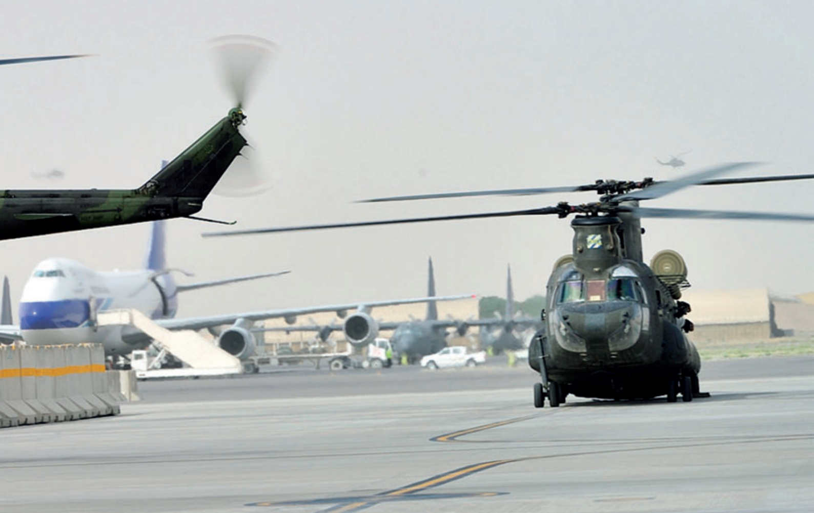
Polish W-3 Sokol.

French helicopters are organized within the 3 separate Army, AF and Navy commands. In the French Air Force helicopters are embedded in two services. The initial pilot training is common with the Army, the Navy and the gendarmerie. It takes place in joint training centers in Dax and Le Luc (Army) for basic training and for instrumental flight. Then the specific training for Air Force pilots continues in Orange. After basic training, follow-up training is conducted at the operational squadrons for combat ready qualification. They accomplish mountain flying in the Pyrenees and the Alps during summer and winter (white out landing); they have the opportunity to train in desert condition (hot temperature) in Djibouti and train brown out in sandy areas in Cazaux. They organise training over sea and gunneries in Cazaux and Solenzara. France exchanges expertise about SAR with Singapore, China, Brazil, India and Switzerland, CSAR with Malaysia, MASA (Artificial Intelligence-based Modeling & Simulation) with Brazil (in Guyana) and India, RESCORT/CSAR with The Netherlands, and mountainous flight