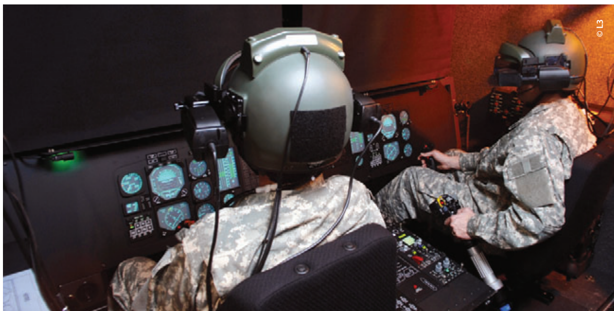
AVCATT, a good example of a very flexible mission simulator used by US Army Aviation.

4.2.9 Cooperation HISWG, HOSTAC and NSHQ. The HISWG covers Army Aviation and Air Force helicopters while the HOSTAC covers Navy and Marine helicopters. There is no clear connection between these organisations while cooperations do increasingly emerge in our Area of Responsibility (AOR's). SOF is a quickly developing area that use helicopters heavily but is not yet connected with these two main NATO organisations. To avoid duplication of effort and improve mutual knowledge/standardisation, cooperation between these three important NATO organisations should be