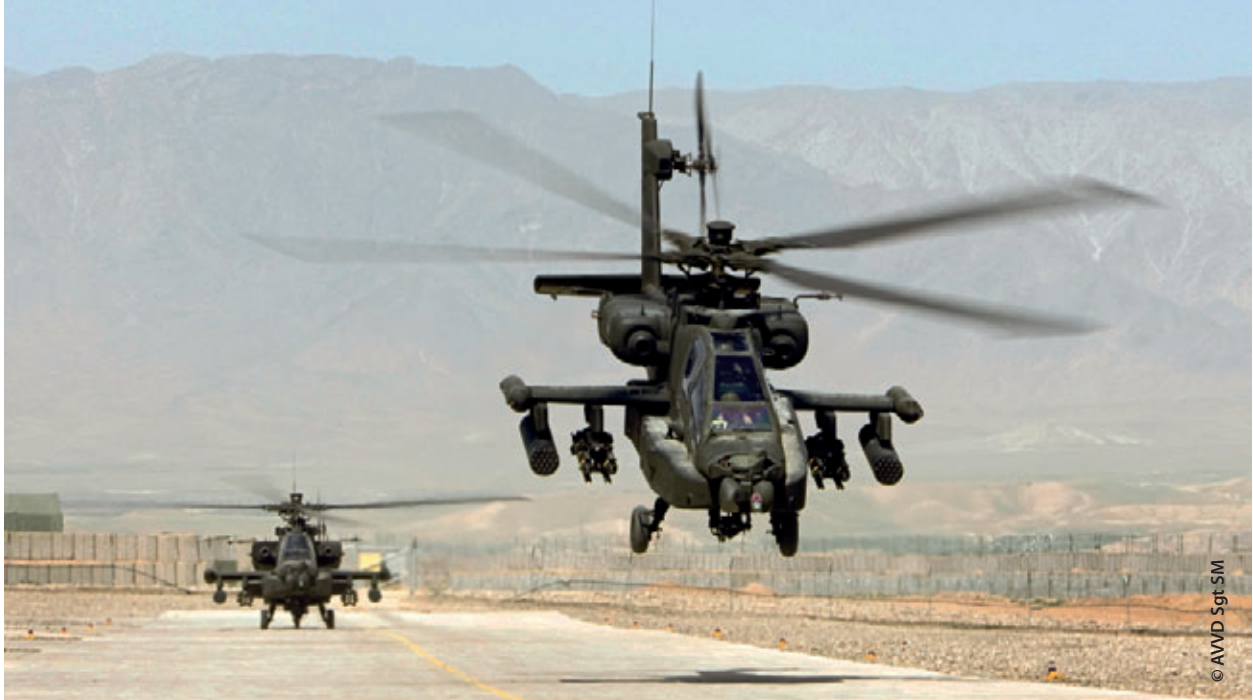
NLD AH-64D Apaches in Afghanistan, a good example of pooling and sharing of helicopters in ISAF.

established starting with liaison participation at the main HISWG, HOSTAC and NSHQ meetings.