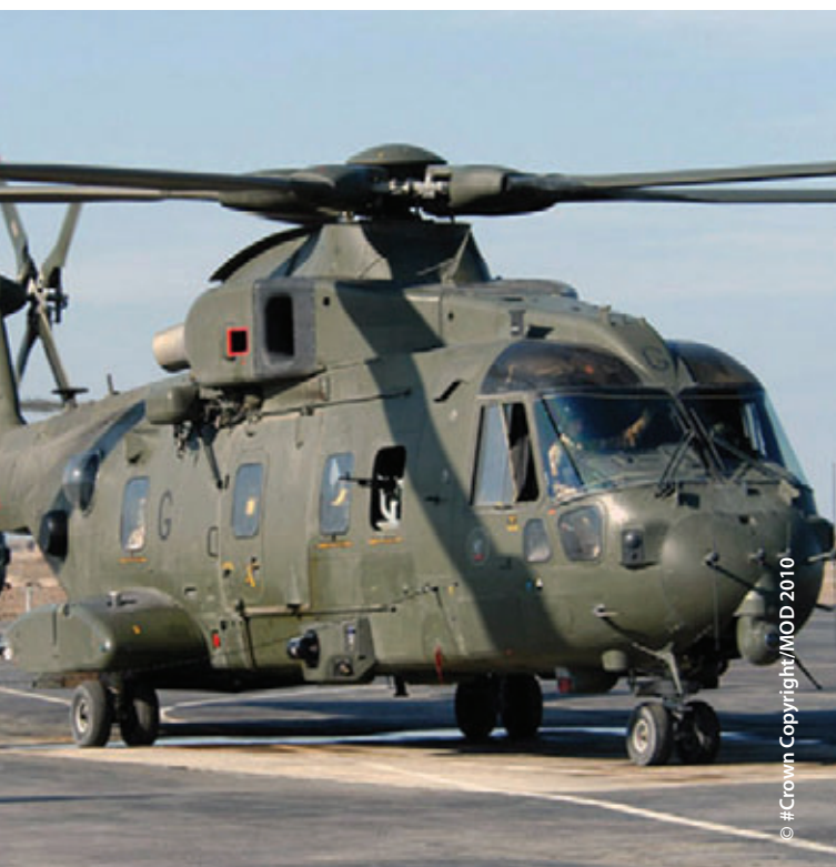
UK EH-101 Merlin.

which is a large national SOF exercise which incorporates foreign helicopters which are tasked as combined units mainly working with infiltration/exfiltration of SOF units, both day and night. Denmark has a Pilot Exchange Programme with GBR.