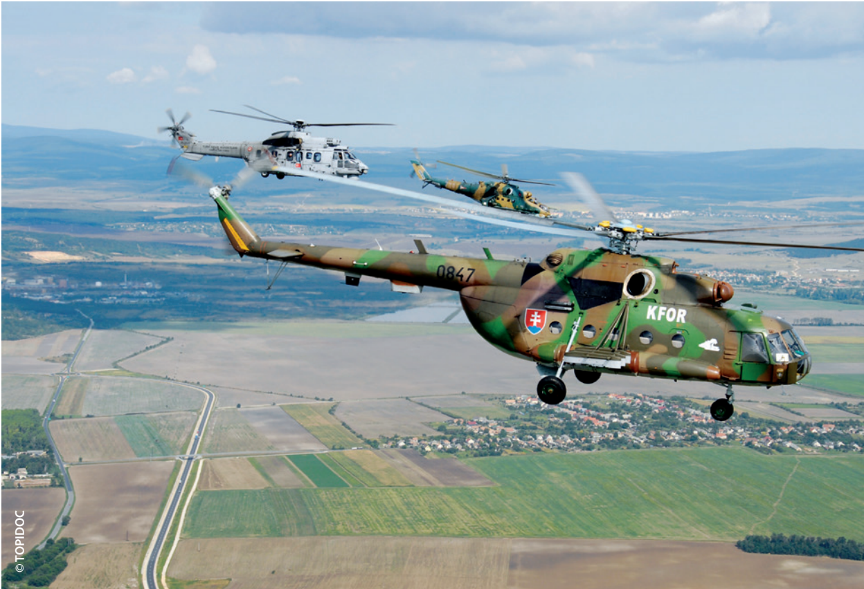
Hungarian, Turkish and Slovakian helicopters during an international training event.