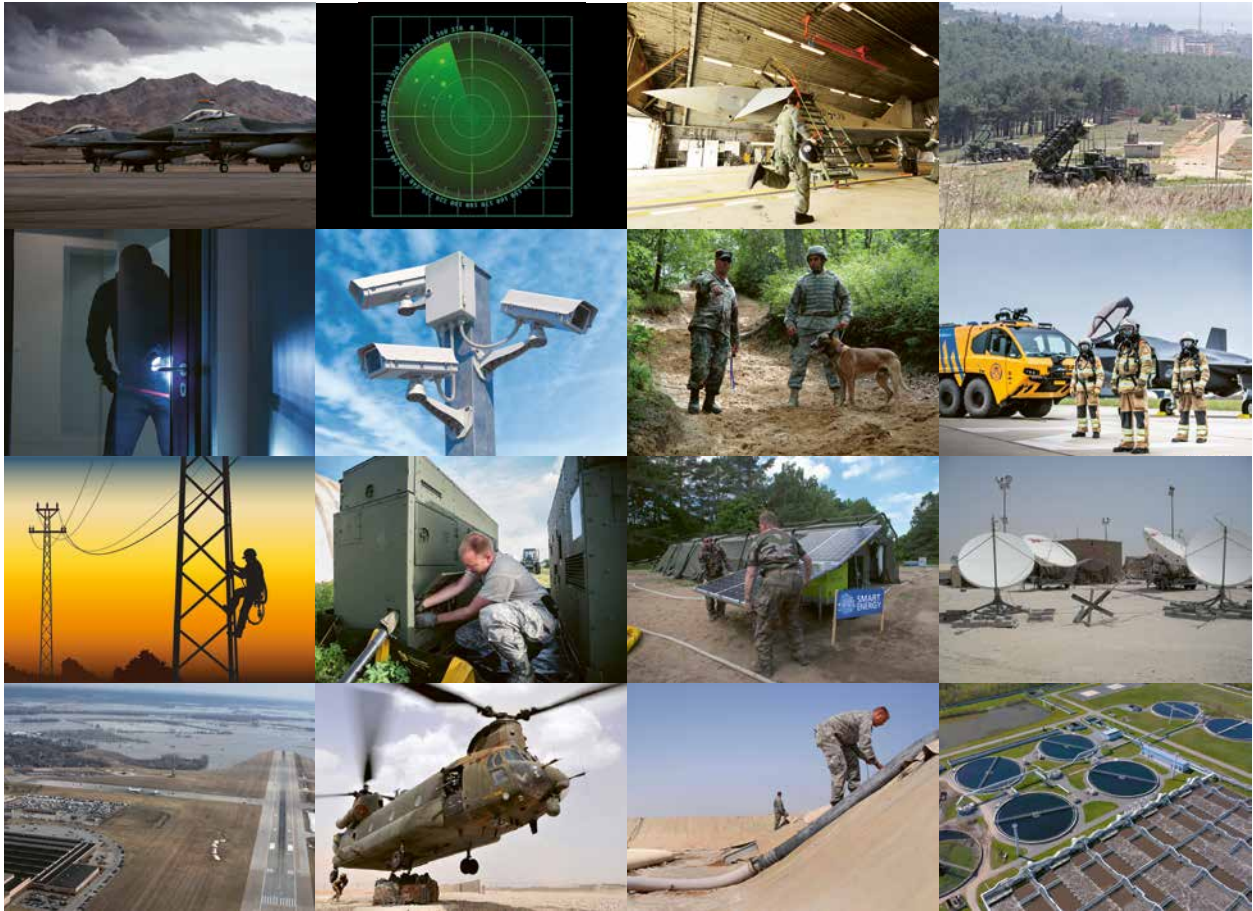
From left to right top-bottom: ; ; ; ; ; ; ;.