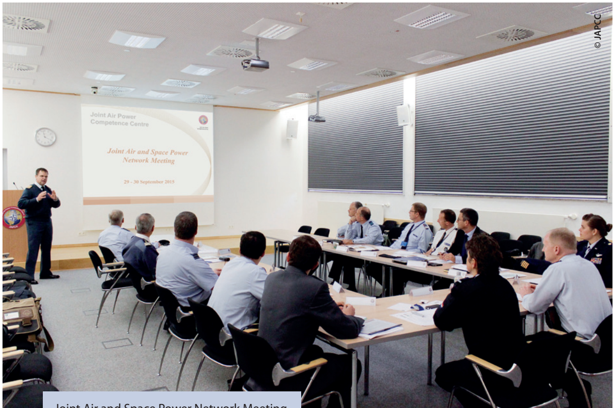
Joint Air and Space Power Network Meeting.

the RED AIR Concept of Operations, scenarios and daily Air Tasking Orders IAW RED Joint Forces operational framework, including Cyber and Space inputs.