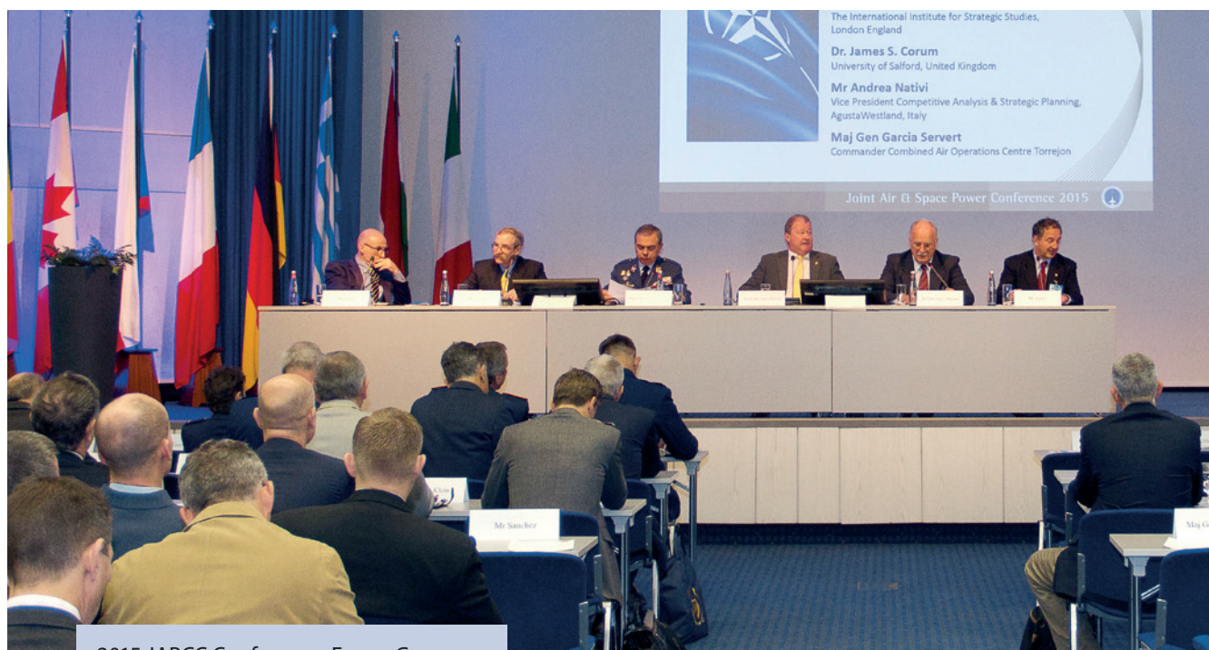
2015 JAPCC Conference, Essen, Germany.

Air Traffic Management (ATM) support to NATO operations. JAPCC provided subject matter expertise to NATO and European forums and Agencies in developing and maintaining the capabilities required for ATM support to the full range of NATO missions in peace, crisis, and conflict. The JAPCC representative was involved in the activities of NATO's ATM Committee, ATM/CNS (Communication, Navigation,