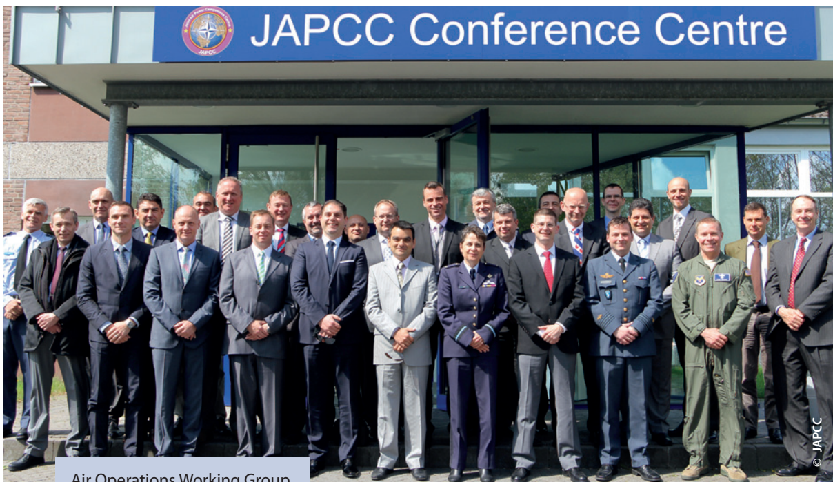
Air Operations Working Group.