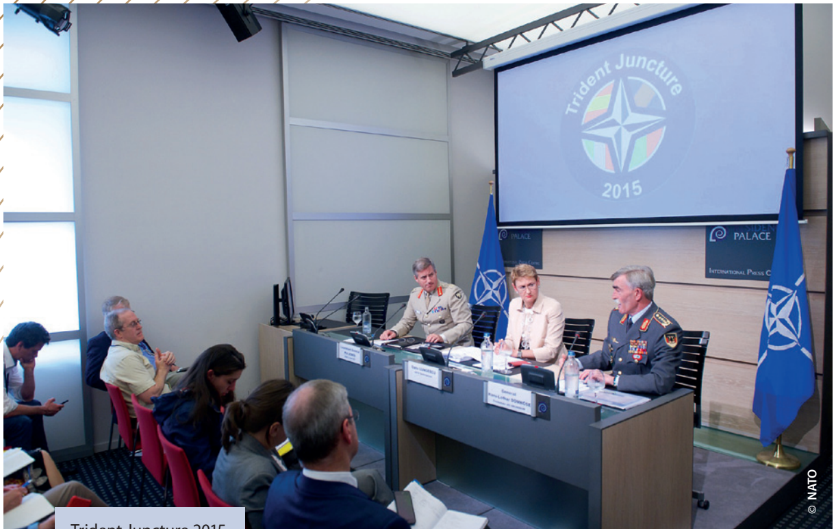
Trident Juncture 2015.

Coherent education and training should offer the bedrock for the development of individuals and teams so they have the cognitive ability to assimilate and understand complex situations and cultures, becoming comfortable with ambiguity and risk.